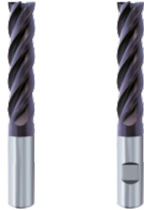
Gühring no. 6767 6768